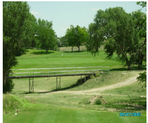
City owned Golf Course cities and Texas County.