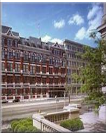
A & D Building 222 E. Central Pkwy Cincinnati, OH 45202