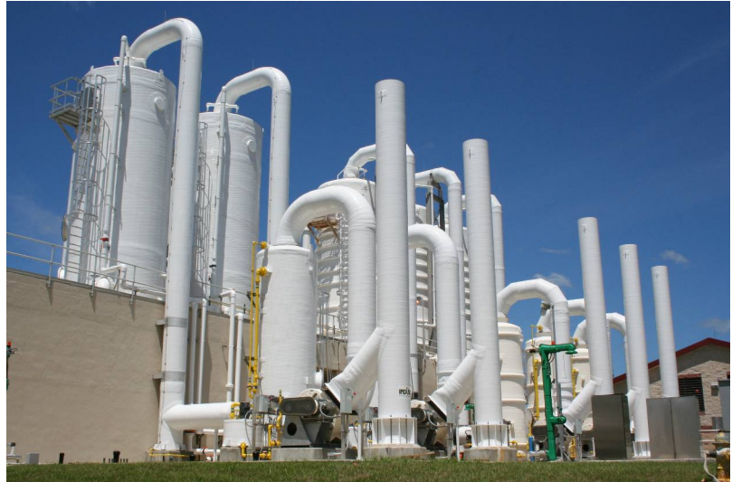
Water Treatment Plant— Opened 9/2007

Additionally, treatment process improvements had been completed during the previous year, resulting in our customers receiving water that continued in 2005 to meet and exceed all required standards, and that was clean with good taste and looks.