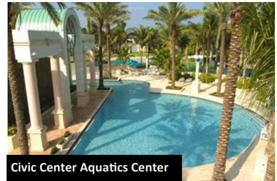
Civic Center Aquatics Center