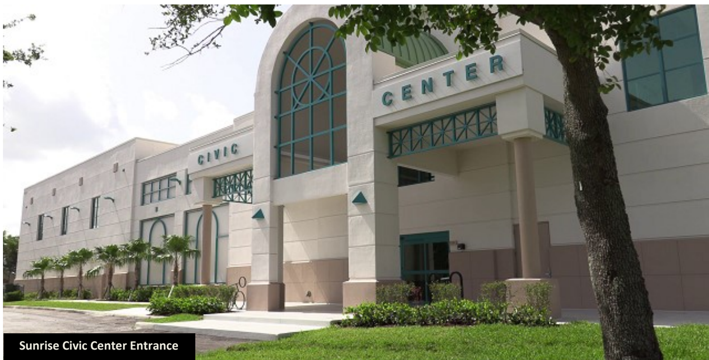
Sunrise Civic Center Entrance

The City seamlessly blends its corporate and hometown identities, offering exceptional amenities to business owners and residents alike.