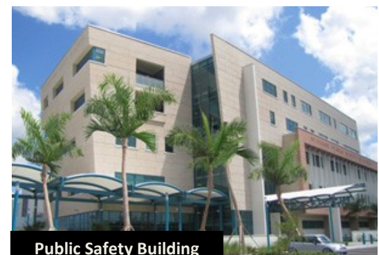
Public Safety Building