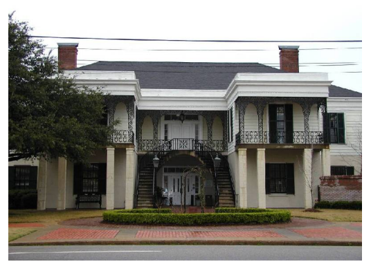
Selma Public Library