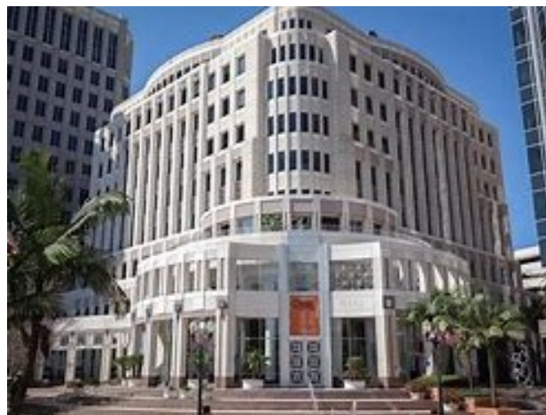
Orlando City Hall

Approximately 90% of Orlando City employees are covered by collective bargaining agreements and represented by one of five unions and nine bargaining units. Sworn Fire Department employees below the rank of Assistant Chief as well as Emergency Communications Specialists are represented by the International Association of Firefighters.