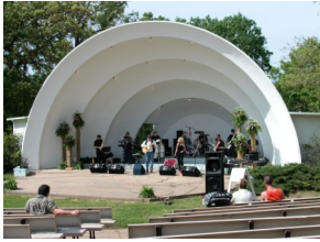
Band Shell in Riverside Park