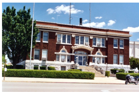
Independence City Hall