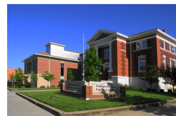
Newly Renovated Carnegie Library