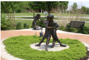
Art in Public Places