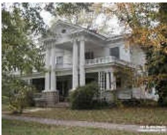
301 South Fourth Street—circa 1881

Legend has it that Independence, in the late 19 th and early 20 th centuries, had more millionaires per capita than any place in the United States. Standing as testimonies to that legend are the stately mansions and historic homes that line many of its streets.