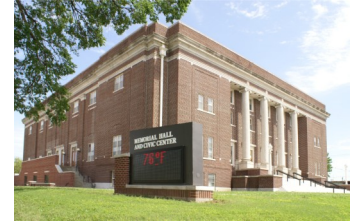
Recently Renovated Memorial Hall Civic Center

The City Commissioners agree that the current City staff is capable and committed. In this context, some leadership/management traits that the City Manager should possess are: