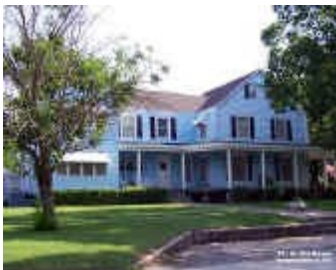
301 North Second Street—circa 1903