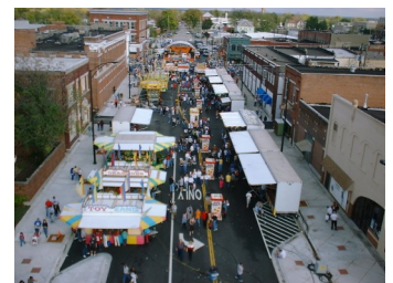
Annual Neewollah Festival

It's Southeast Kansas' largest celebration. Held in the last week of October, Neewollah's musical stage shows, carnival, concessions, entertainment and grand parade attract more than 80,000 visitors each year.