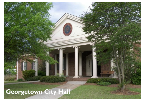
Georgetown City Hall