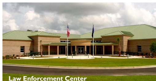
Law Enforcement Center