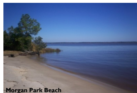
Morgan Park Beach