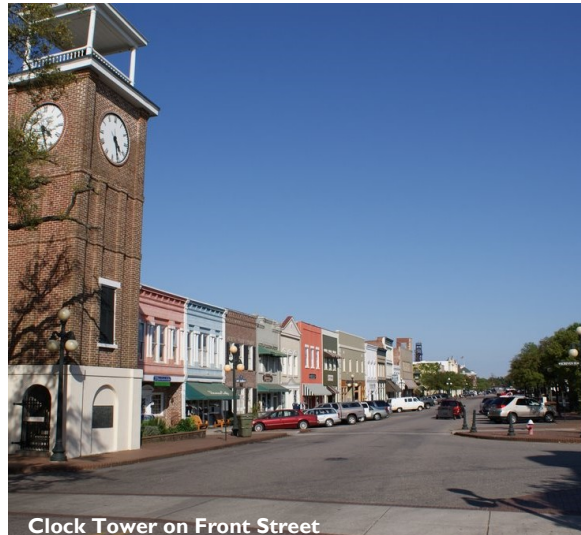
Clock Tower on Front Street

For more information about this unique opportunity, visit Georgetown on the web at www.cityofgeorgetown.com .