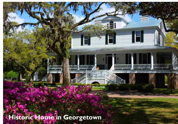
Historic Home in Georgetown