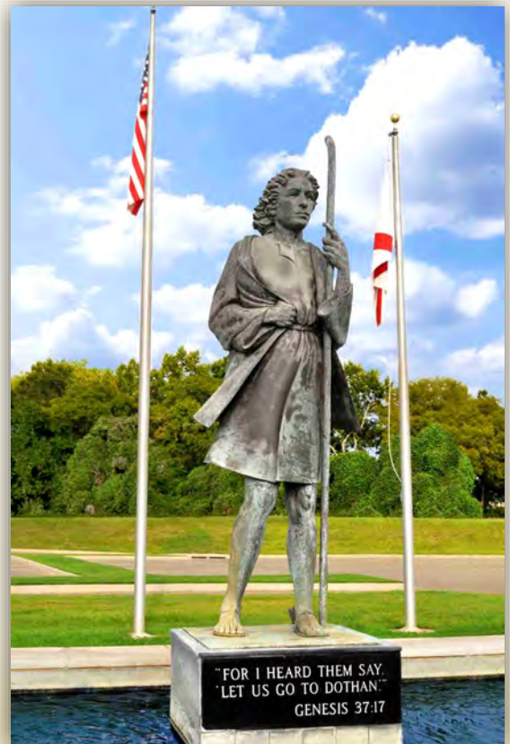
JOSEPH STATUE AT MILLENNIUM PARK

In the 1830s a fort existed on the Barber Plantation, ten or twelve miles east of Poplar Head, named for the poplar trees that encircled the glade where the cool water, or "head" (as springs were often called), welled from the earth. This was where the settlers from the surrounding areas could go when they felt threatened by the Indians. By 1840, the Indian wars in Alabama were over and the fort soon disappeared. By 1885, the hamlet had grown into a village. The settlers realized that if the community's growth was to be sustained, they needed a governing body and local law enforcement. On November 10, 1885, the people of Poplar Head voted to incorporate and named the town Dothan, after Genesis 37:17 "And the man said, They are departed hence: for I heard them say, Let us go to Dothan. And Joseph went after his brethren, and found them in Dothan".