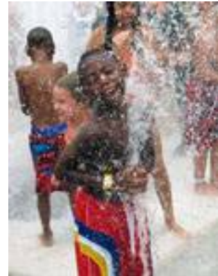
Children play at Town Center Park