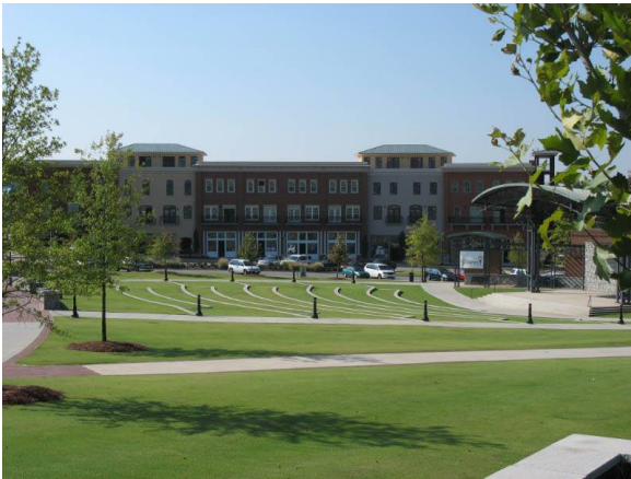
Town Center Park

The City Manager is responsible for managing and directing the daily operations of the City government in accordance with local ordinances, law and with policies prescribed by the Mayor and Council.