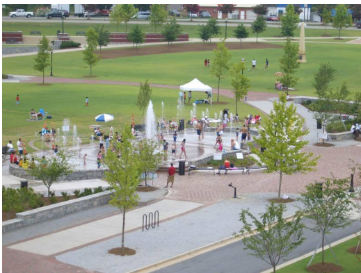
Town Center Park