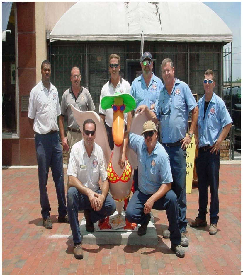
Department staff with "Pelican in Paradise"

Knowledge of modern recreational organization policies, objectives, services, and equipment. Knowledge of administrative procedures and departmental rules and regulations. Knowledge of pertinent Federal, State and local laws and ordinances governing the activities of the Department. Knowledge of plants, shrubs, and trees indigenous to the region. Knowledge of modern management techniques and methods. Ability to supervise the work of others. Ability to plan, assign and evaluate the work of professional, technical and clerical subordinates. Ability to exercise good judgment in evaluating situations and making decisions. Ability to speak and write effectively. Ability to prepare clear, concise and comprehensive reports. Ability to establish and maintain effective working relationships with associates and the general public.