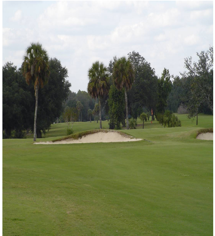
Osceloa Golf Course